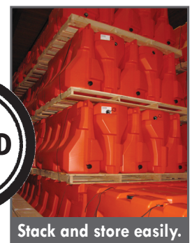
Stack and store easily.